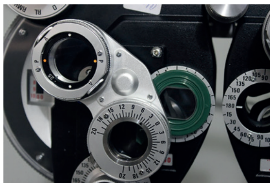
FIGURE 1. Example of a base-out prism of unknown power attached to the phoropter using Velcro

Each session began with the right eye being occluded for 10 minutes. This period was selected to allow any vergence adaptation induced by visual activities conducted before the start of the experimental session to dissipate (6,9,10). The near heterophoria was then measured (without any supplementary prism) using either the VG, MR or MT techniques. After a period of at least 24 hours, this heterophoria measurement was repeated using the same technique with an unknown prism in place. This sequence was repeated for the other two procedures, with a period of at least 24 hours between the experimental sessions. The order of performing the three tests was counterbalanced across subjects. One measurement of heterophoria was recorded for each experimental condition.